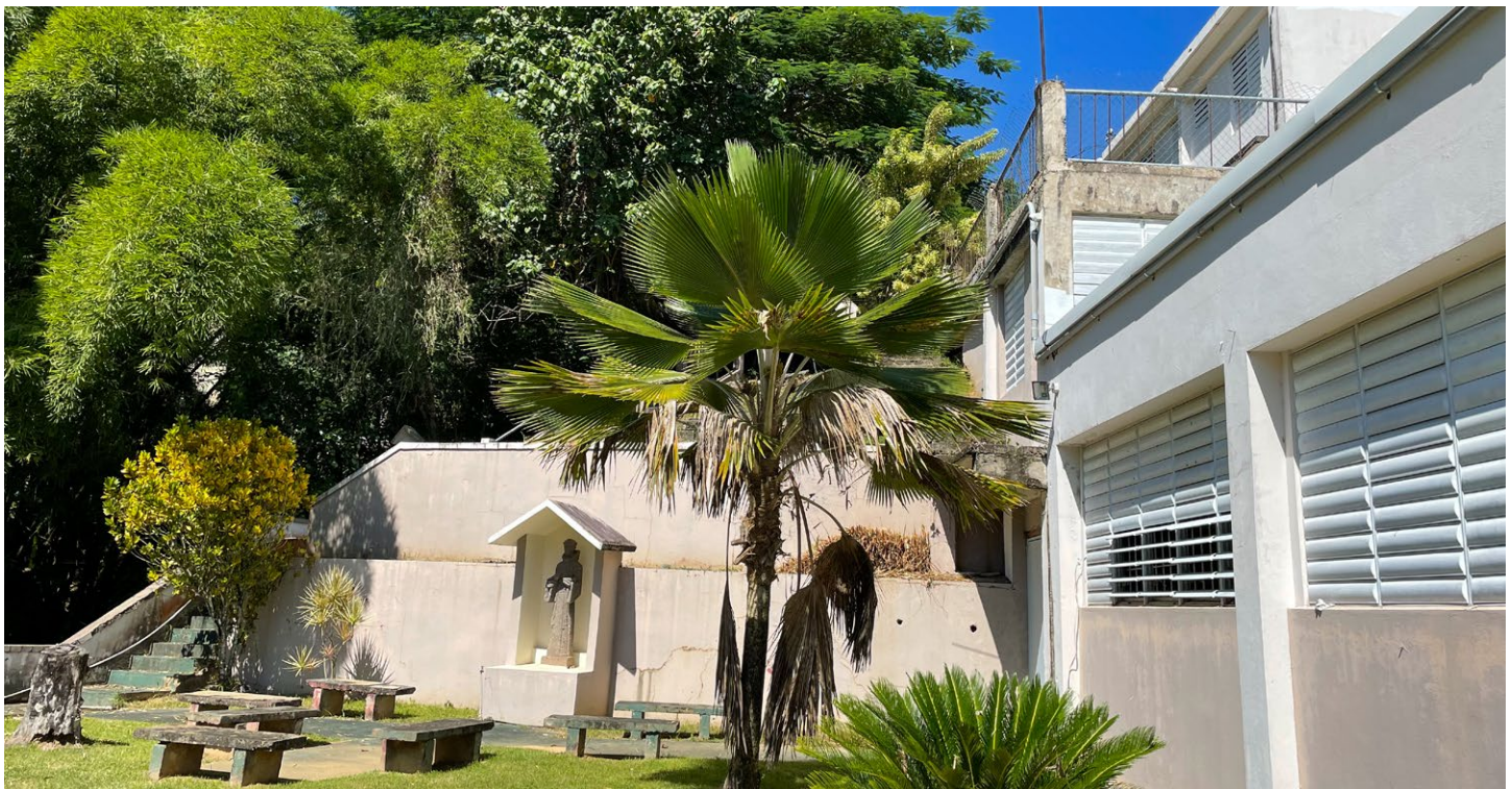
Four stories of La Casa hug the mountain side.