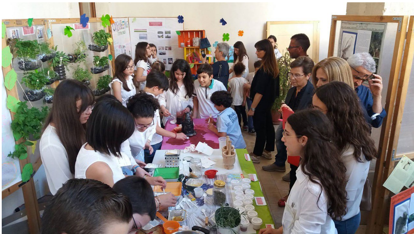
The Teaching Garden conducts a teaching lab for a visiting school group. BELOW: Earth Day presentation.