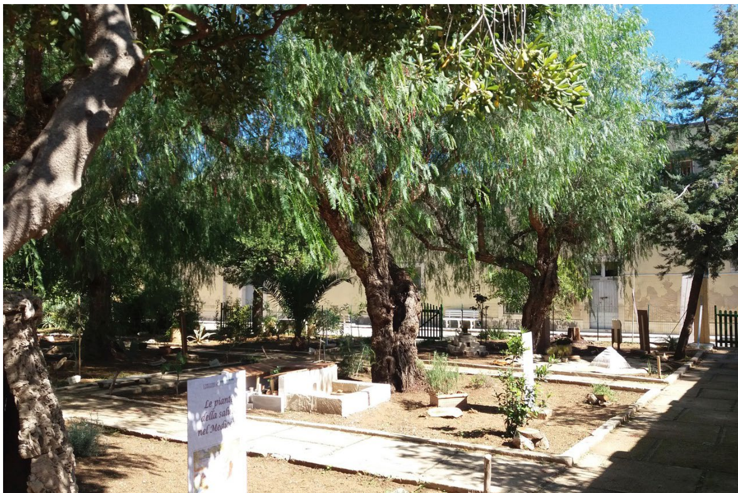
View of the plants and herb beds in the Brother Simplicius Teaching Garden.