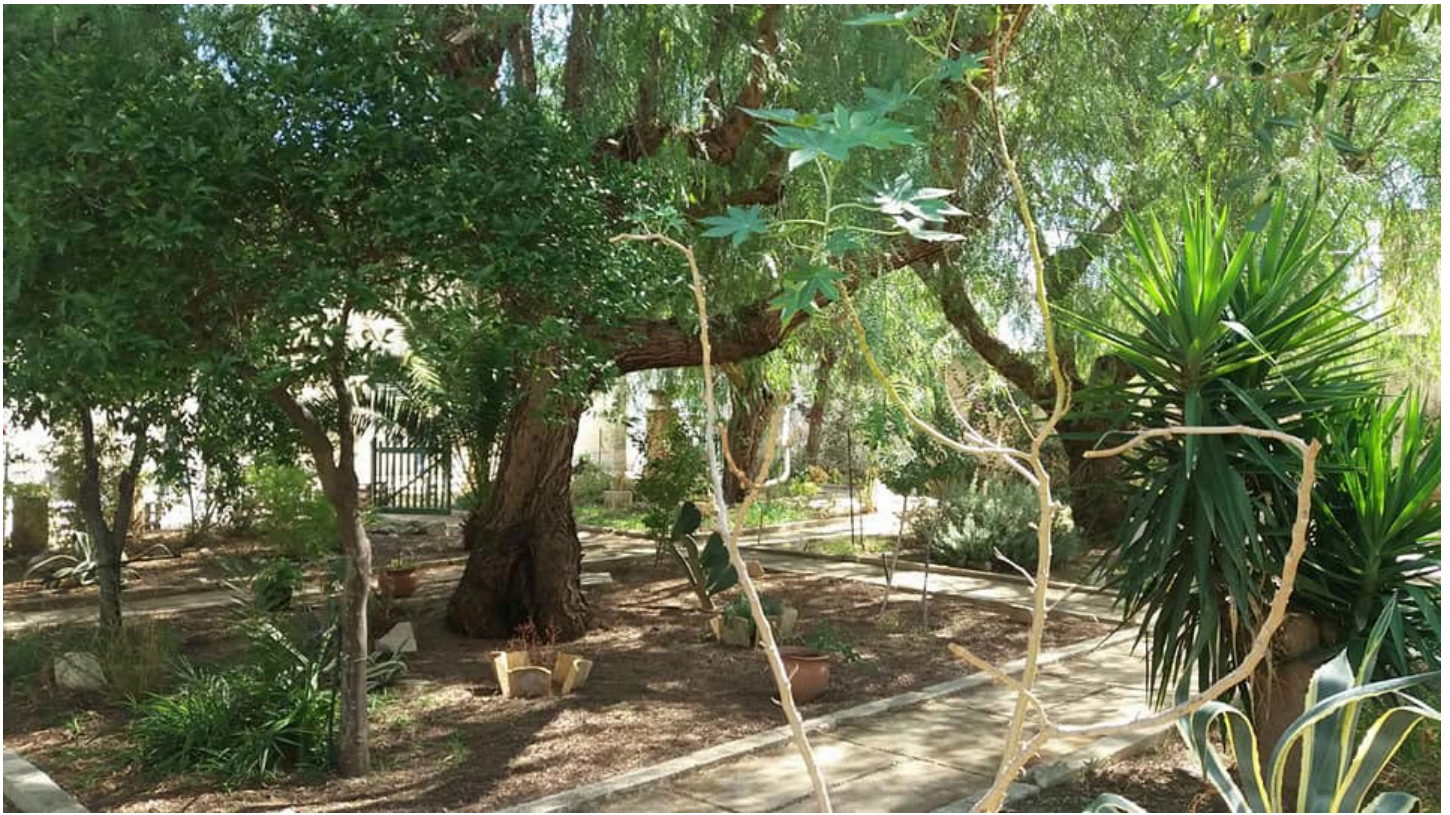
View of the plants and herb beds in the Brother Simplicius Teaching Garden.

A garden of simples that OFS of Vittoria (Sicily, Italy) offers to the town