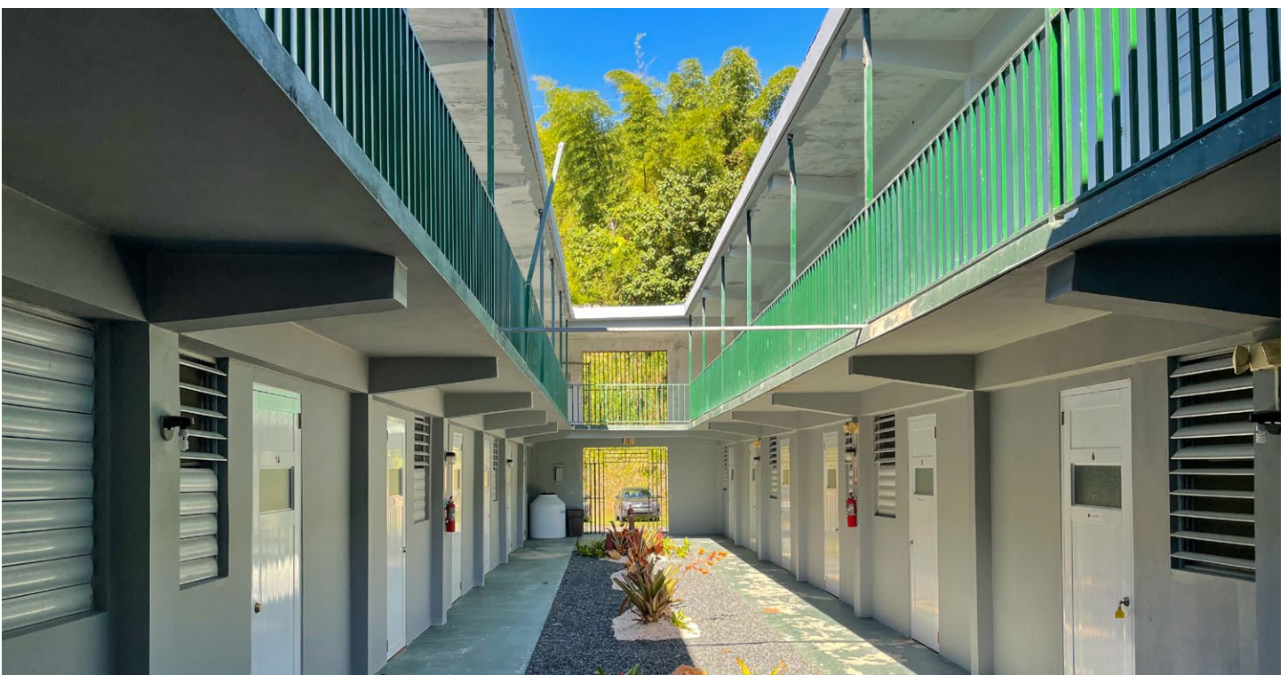
Guest rooms flank an open courtyard at La Casa.

The headquarters building, which Continued on next page.