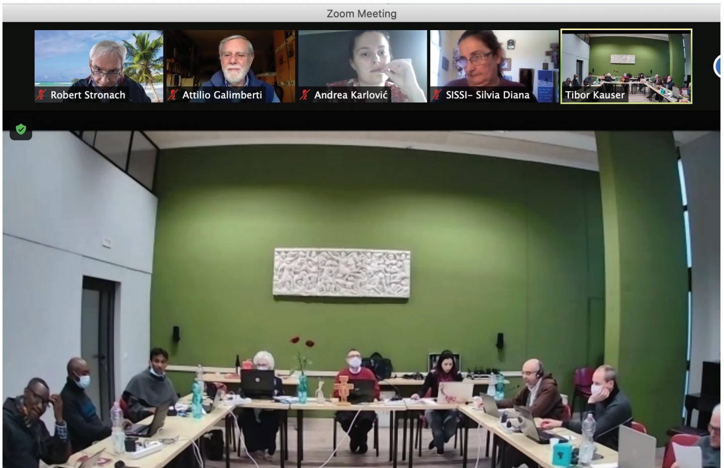
CIOFS Presidency's meetings in Rome -- hybrid (above) and entirely video conferencing (below).