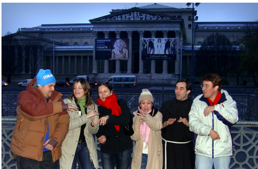
YouFra contingent singing and dancing in Heroes' Square.