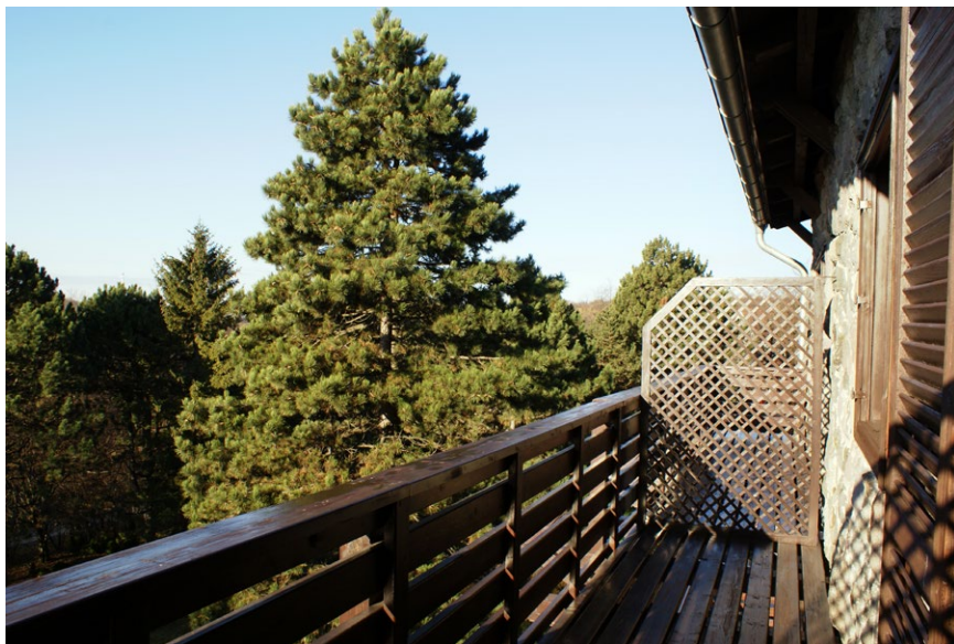
The view from our balcony.