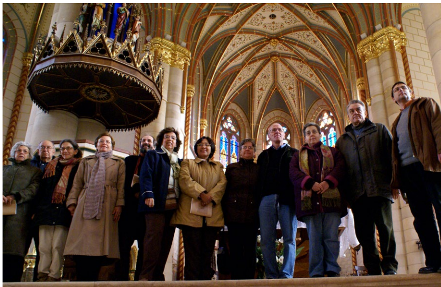
The Presidency and Secretariat.

statue of St. Stephen -- sporting a halo and mounted on horseback -- in the center of a square in one corner of Castle Hill. Encompassing an entire hilltop, Castle Hill “is more like a city than a fortress,” noted Tibor. Within the castle’s walls are houses, apartment buildings, stores of all stripes, churches, archeological digs, the former Royal Palace (which is now a royal art gallery and museum of natural history), and the offices of the president of Hungary. Castle Hill overlooks downtown Budapest, split in two by the wide winding Danube. The Hungarian seat of government, the Parliament, rises up from the far edge of the river, dominating the cityscape.