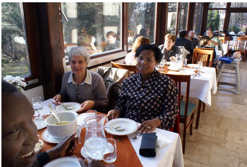
Meeting Secular Franciscans in the dining room at Manréza.

or dumpling-like noodles (sometimes rice and potatoes). A few peas or beans were caught hiding in the starch. There were bottles of red and white wine on every table. The meals generally were tasty and filling. The desserts were superb. A different treat every day, from delicate