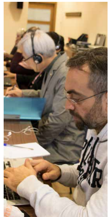
CIOFS Presidency members gathered in Rome from March 18 to 25, meeting from morning to night on the business and spirit of the worldwide Secular Franciscan Order.