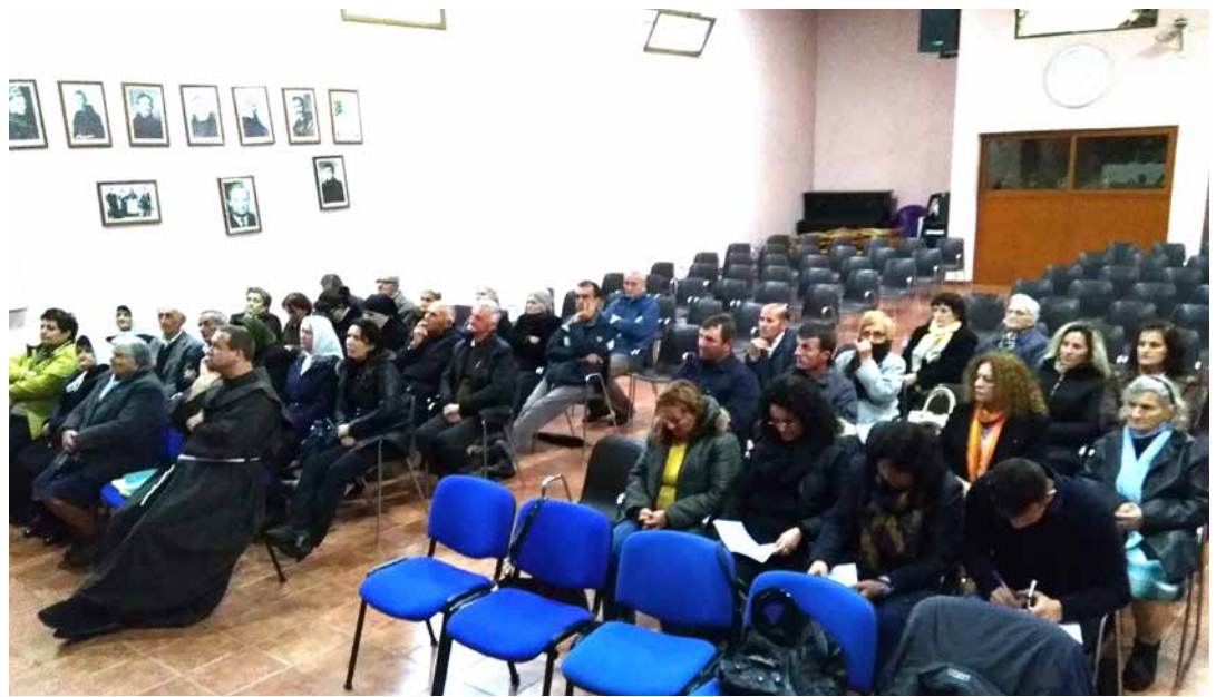
Delegates and observers attend the Albania chapter.