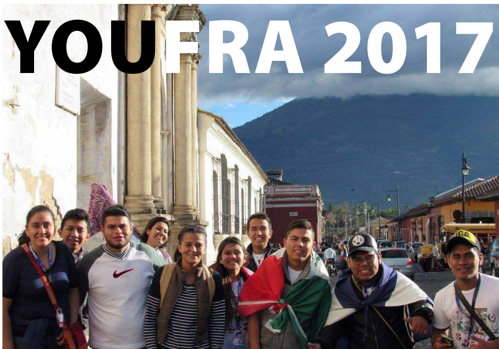
ABOVE AND BELOW: Some of the YouFra participants at the gathering in Guatemala.