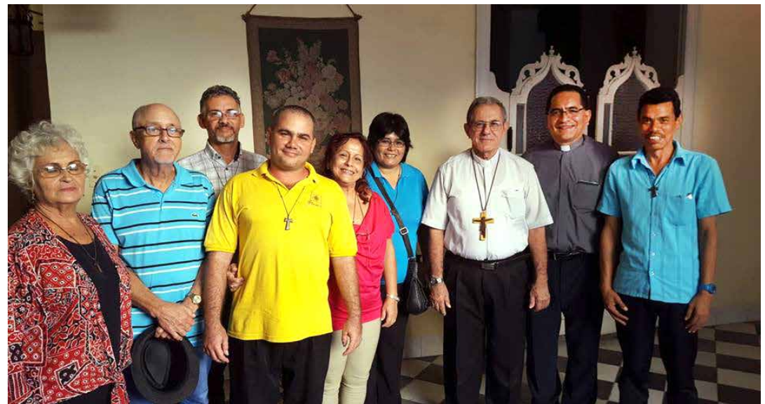
Secular Franciscans and visitors meet with the Havana archbishop.

The visitors were hosted by the Capuchin Friars at the convent-church of “Cristo de Limpías” in the old Havana quarter. Most of the meetings were held at the Church of Saint Francis in the historical center of the city, managed by the OFM Conv. Friars. The visitors held