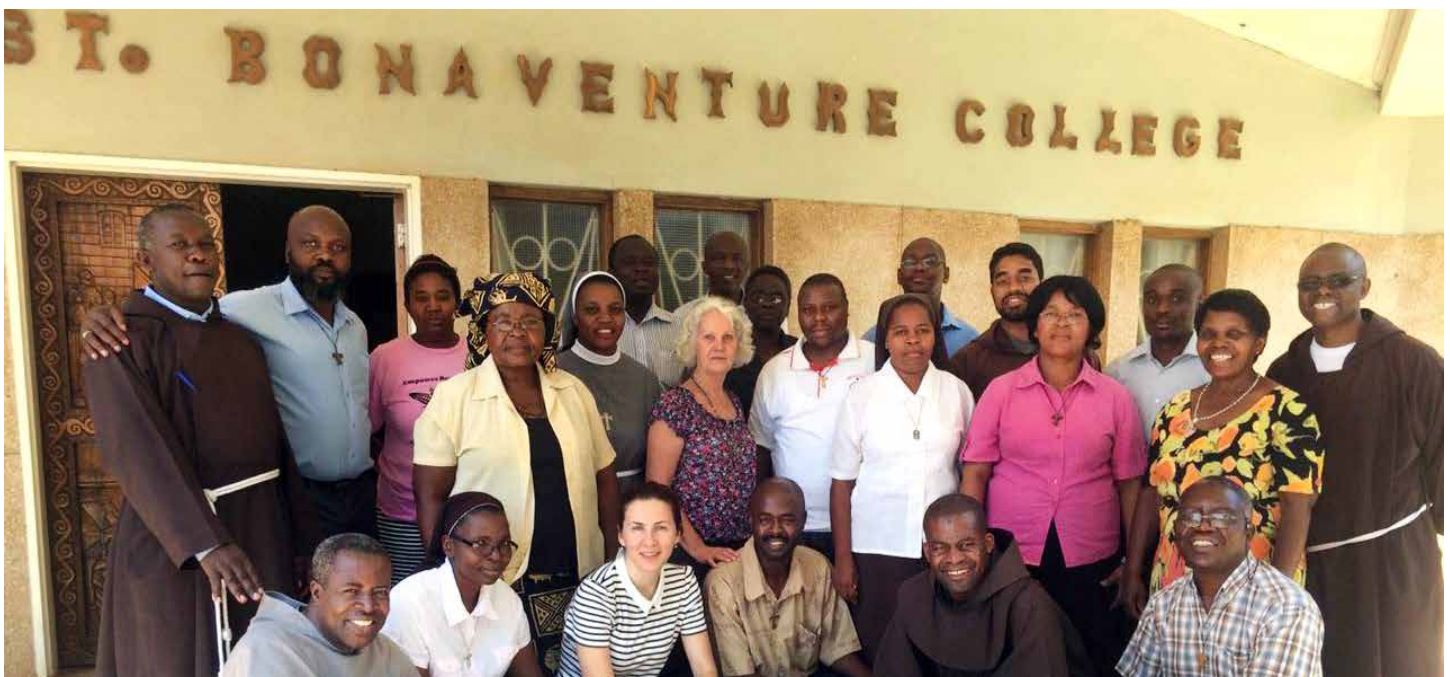
Participants in the JPIC and YouFra animators workshop held last November in Lusaka, Zambia.